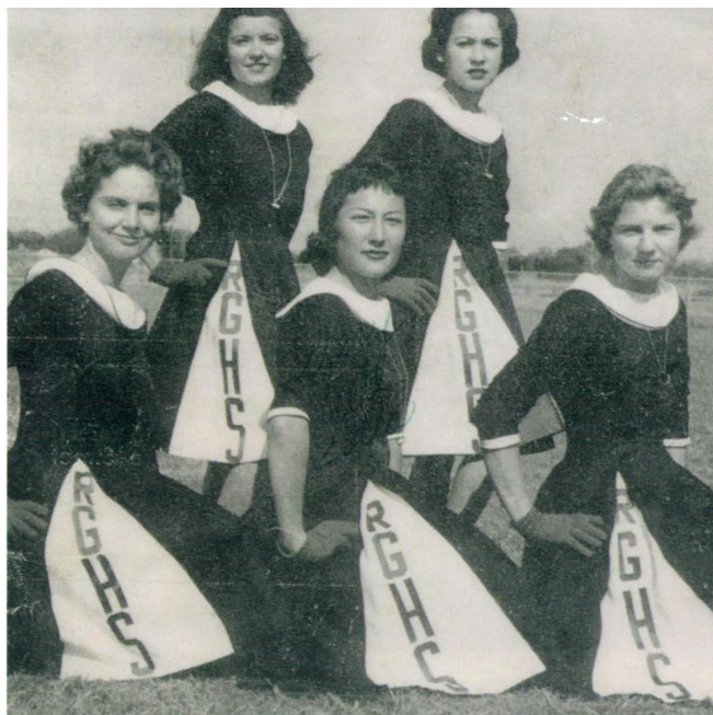
1960 RGHS Cheerleaders